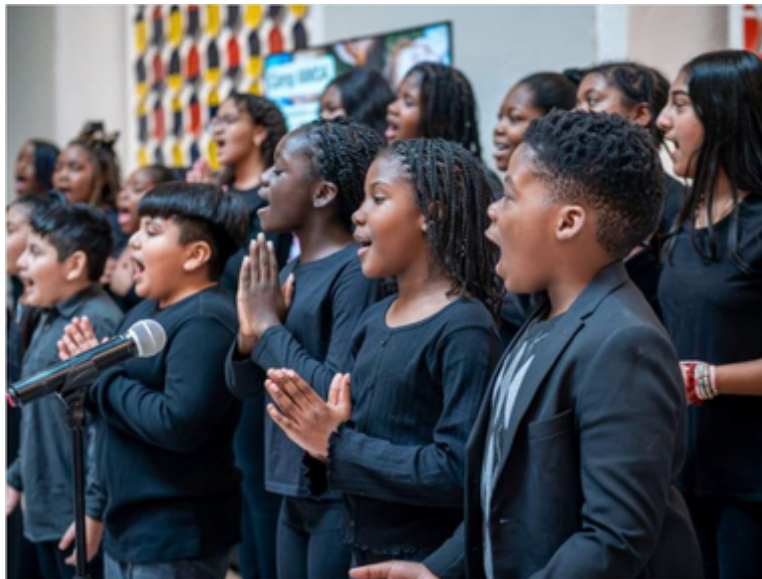
Black History Month at NMOA — The Newark Museum of Art

We use cookies on this website to minimize alerts and track analytics. See Privacy Policy